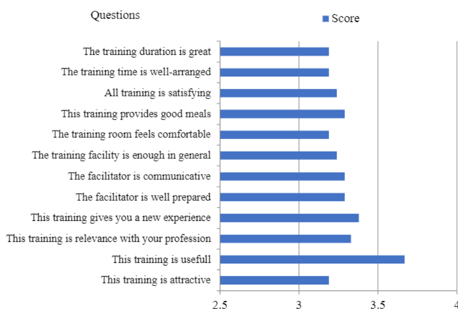
Figure 2 Evaluation of Training Implementation

After the training, the evaluation process of the training consisted of general evaluation, evaluation of sources and evaluation of training materials. Evaluation results can generally be seen in the Figure 2 .